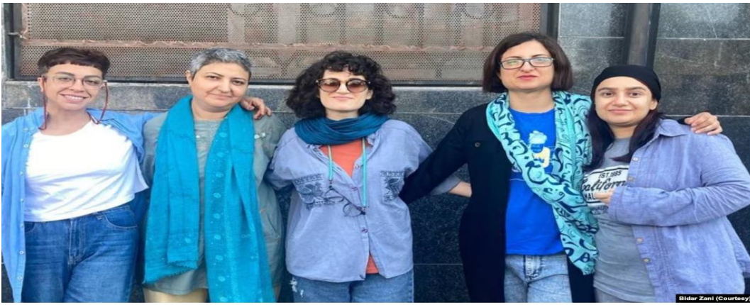
شماری از فعالان حقوق زنان در استان گیلان که برای اجرای حکم حبس خود را به زندان لاکان رشت معرفی کردند.