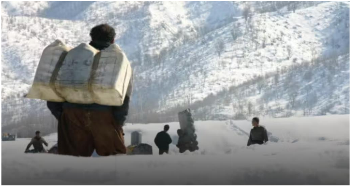
گروهی از کولبران در مرز ایران با کردستان عراق