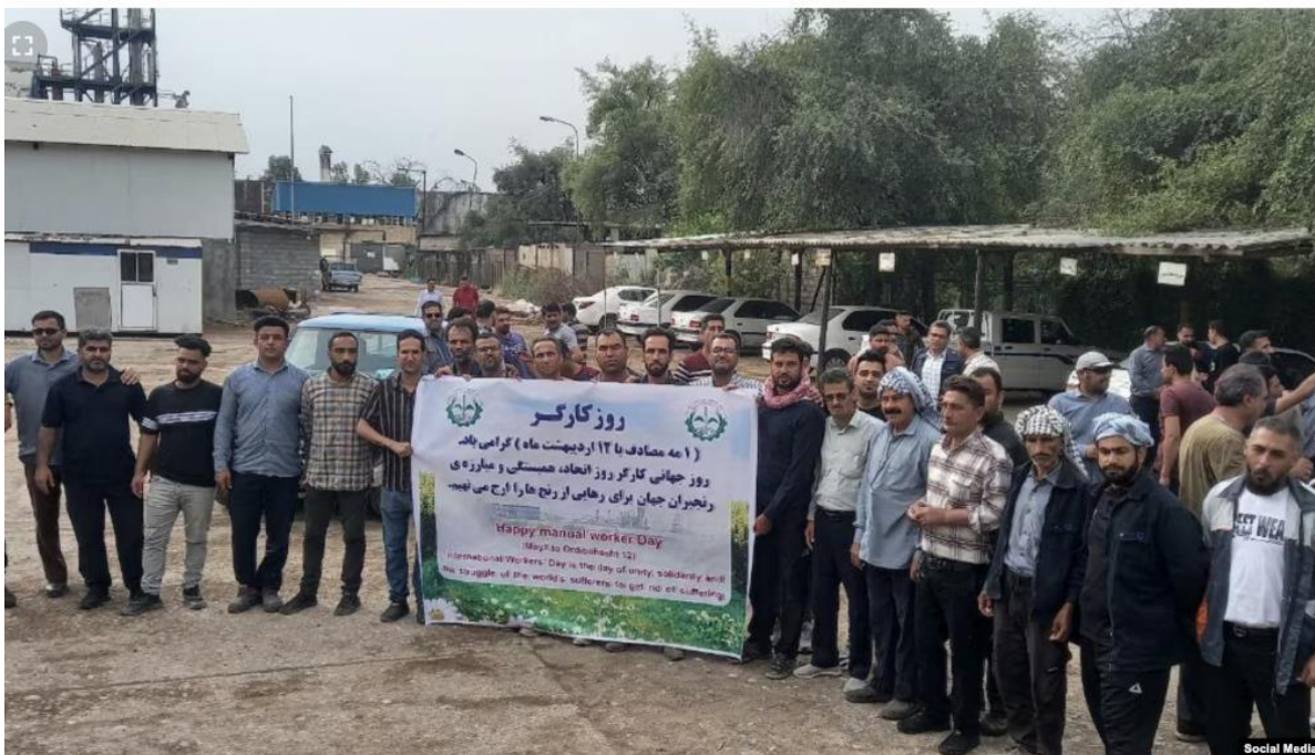
تجمع کارگران شرکت نیشکر هفت تپه در روز جهانی کارگر، ۱۴۰۳